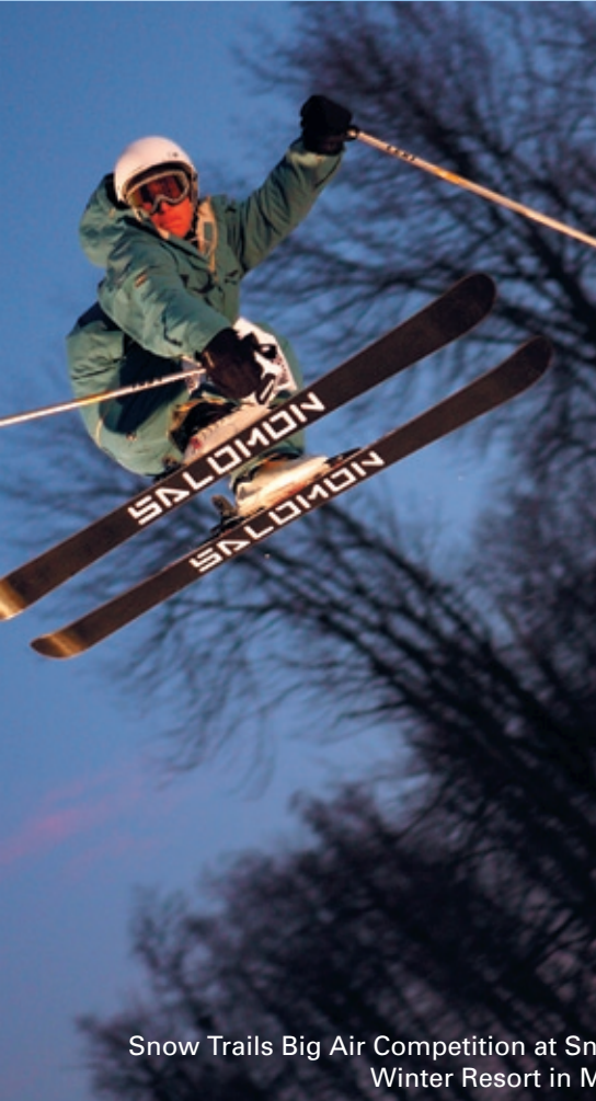
Snow Trails Big Air Competition at Snow Trails Winter Resort in Mansfield.